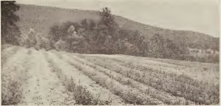
Block of our Hall's Honeysuckles two year plants showing nice growth May 1, 1953.